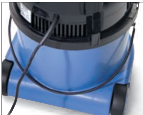
Pail-Style Emptying Handle