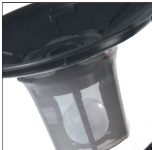
Safety Float Valve