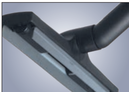
Wet Pick-Up Nozzle