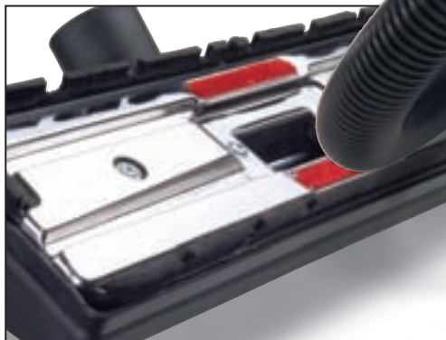
Stainless Brush Plate