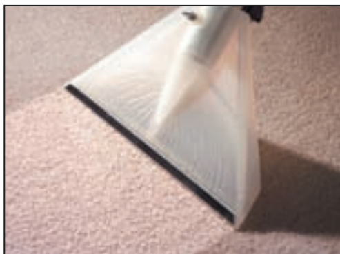
See-Thru Extraction Pick-Up