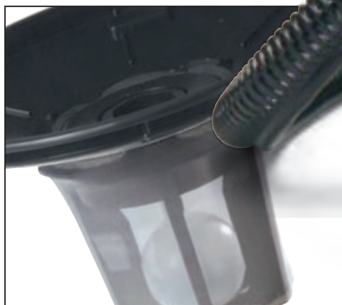
Safety Float Valve