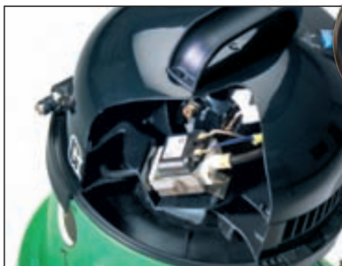
Powerflo' Pump System