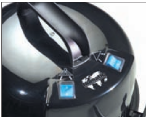
Spray and Extraction Switches